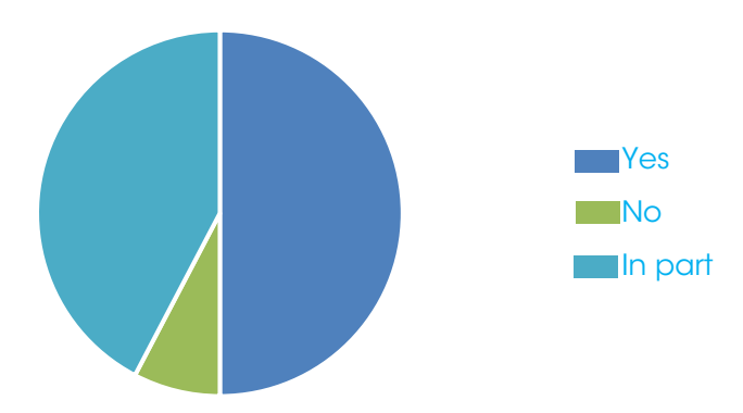
Figure 2: Response to Question 2: Do you support the revised precinct plan?