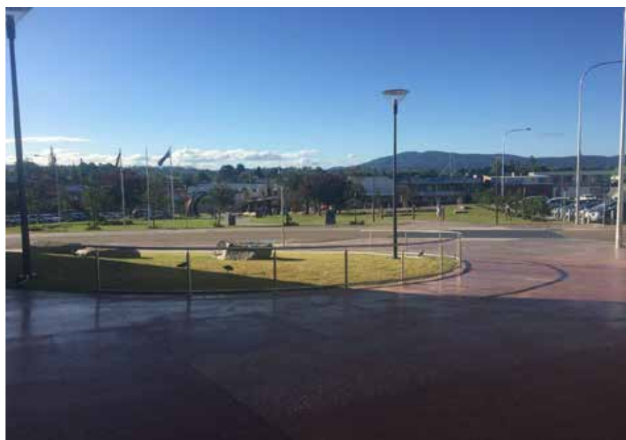
New accessible pathways and Civic Centre forecourt in Bega