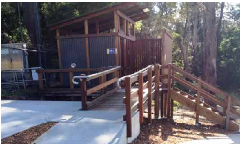
New accessible amenities at Pambula River mouth

Council has been working hard in recent years to improve access to our facilities and services, here are some examples: