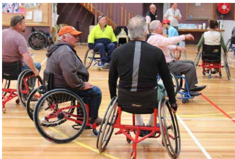
Wheel chair basketball demonstration and awareness day at Bermagui