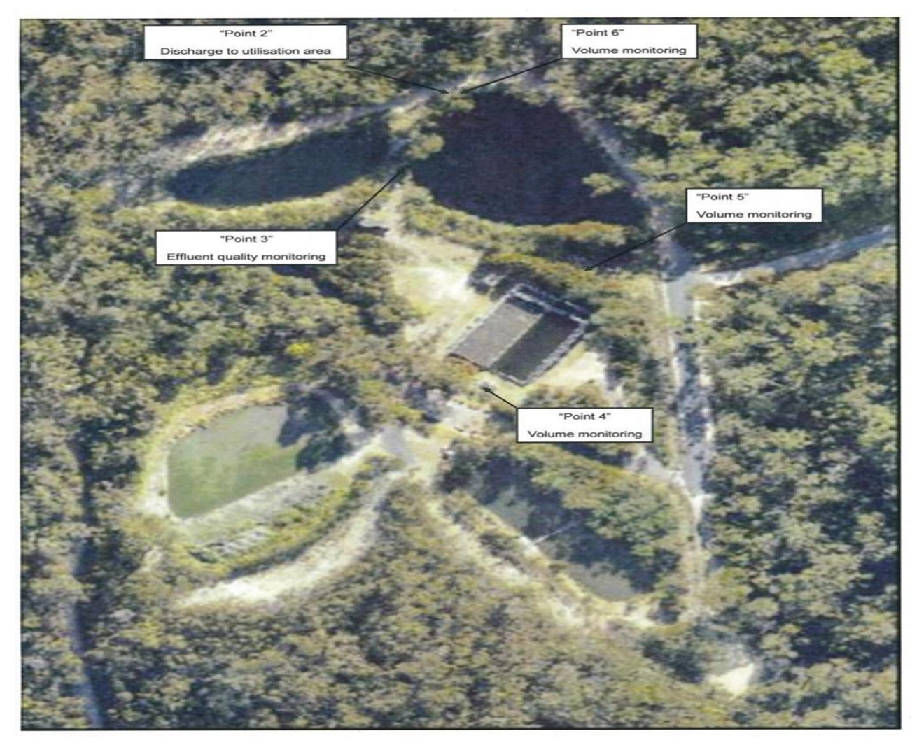
8, 9 MAP – EDEN SEWAGE TREATMENT PLANT