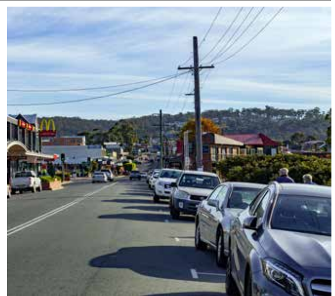
An independent report into the provision of car parking spaces in the Merimbula CBD has been released.

Head to Council's website to view the full report.