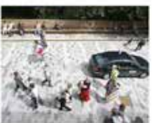
MULTI PURPOSE ZONE