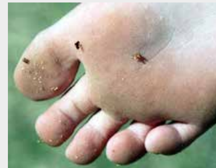
A bindii control program is currently underway at Council parks and reserves across the Shire.

A routine bindii control program has kicked off at parks, pools and reserves across the Shire this week.