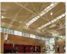
INTEGRATED STORAGE, NATURAL LIGHTING & VENTILATION