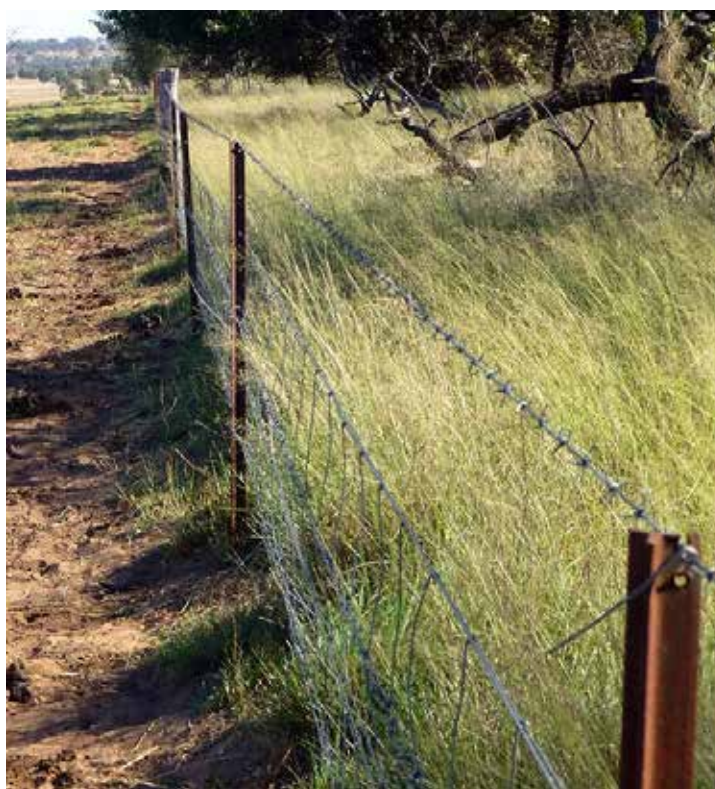
The effective management of weeds such as African Lovegrass continues to be a priority across the Shire.

The local plan now stipulates more defined measures for isolated infestations which are controllable and buffer lines on infected properties to protect production farms and environmentally sensitive land.