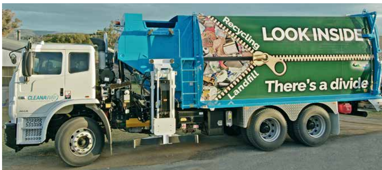
Cleanaway's new split trucks highlight the two separate chambers for landfill and recycling.

Cleanaway, a multi-national network of waste contractors, started Bega Council's kerbside