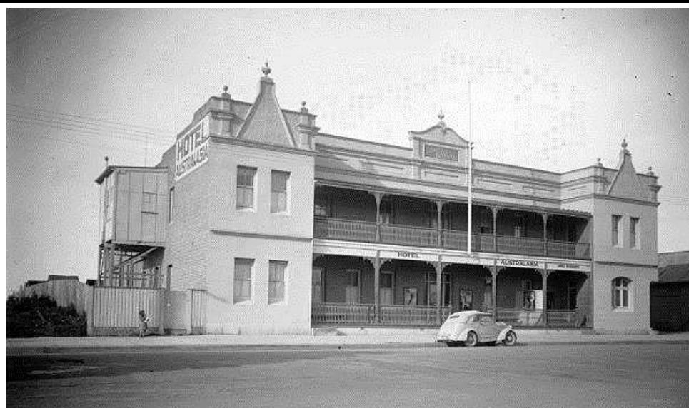
Council is moving forward with the sale of the former Hotel Australasia in Eden by engaging the three Eden real estate agents to provide detailed marketing plans.