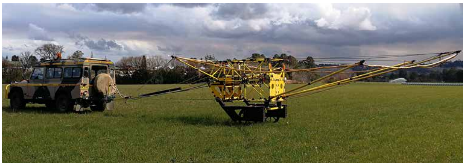
An AgTEM geophysical survey was conducted last week as part of an important study into the groundwater around Bega and identification of production bore locations for the long-term sustainable supply of drinking water.

Specialist engineering firm SMEC Holdings have been engaged by