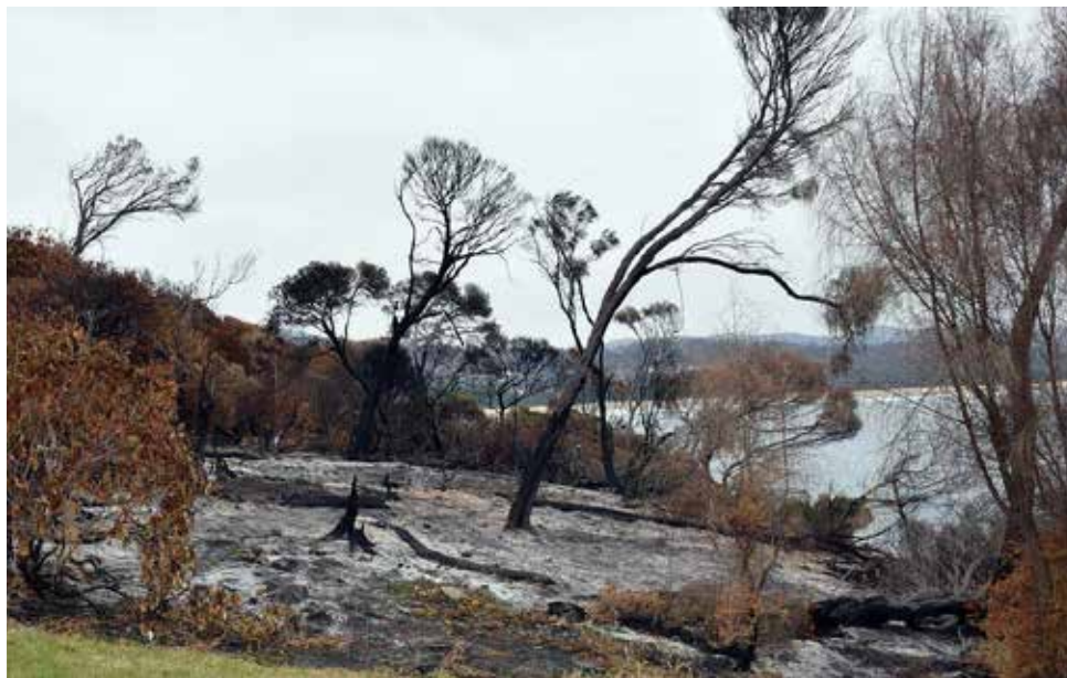
The fire impacted sections of the Tathra Headland are the subject of a restoration program that commenced this week.

"Plans are afoot to hold a community event during the October school holidays to assist with the plantings.