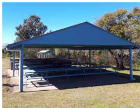
A project to restore the Bega Cheese Apex Park at North Bega has it back to its former glory.