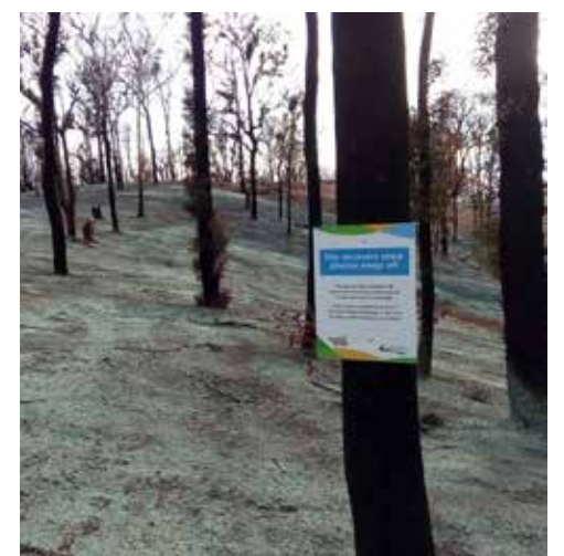
Council's contractors have been busy spraying Hydromulch over the bare ground in the the asset protection zones in and around Tathra over the past couple of weeks in an effort to stabilise the areas and speed up the rehabilitation process.