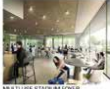
MULTI USE STADIUM FOYER