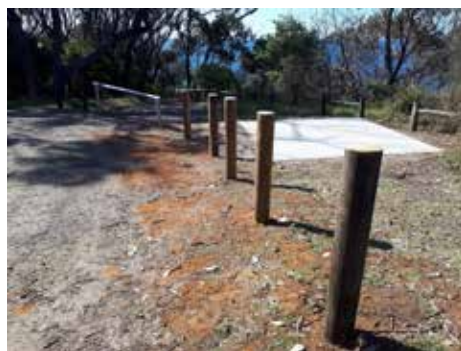
Bollards have been installed at Michael Learner lookout to minimise erosion caused by vehicles.

The old damaged picnic table has been removed and a slab installed for a new table, while dead vegetation has been tidied.