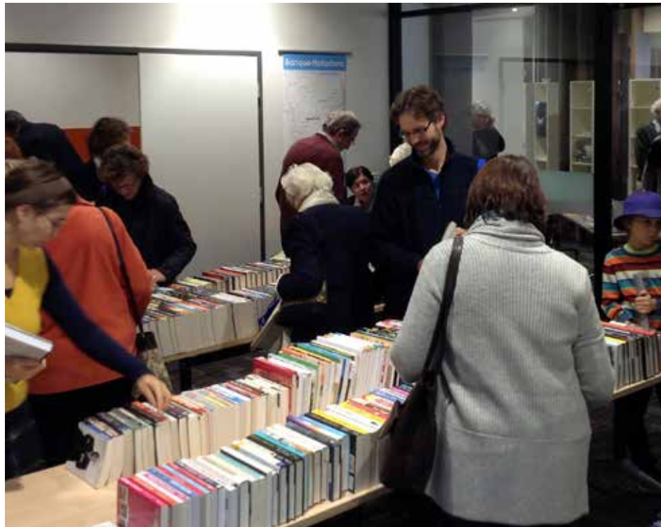
Previous book buying events at the Bermagui and Tura Marrang Libraries have proven very popular.

On the day, there will be a wide range of adult and children's fiction and non-fiction titles to choose from and library staff will be on