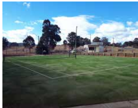
The Wyndham Tennis Courts and Skate Park have come in for some attention.

Shelters will be given a spruce up over the coming days, along with the street trees and shrubs leading into the reserve.