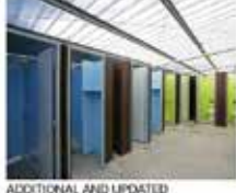
ADDITIONAL AND UPDATED CHANGEROOMS