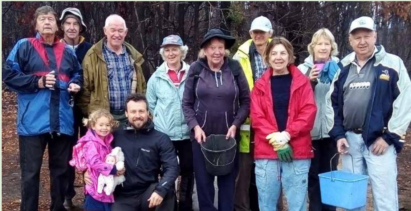
The Tathra Landcare group continued their tireless work in restoring the fire impacted areas in and around Tathra with a recent working bee that focussed on spreading grass seeds.

A working bee on 25 August represented the latest in the tireless work being carried out by the Tathra Landcare group to restore the fire impacted natural areas in and around Tathra.