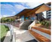
CLUB ROOMS AND UPPER LEVEL SEATING