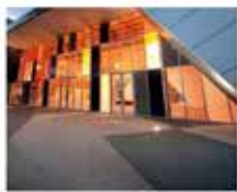
INTEGRATED STADIUM ENTRY AND FOYER

“Among the multitude of improved and new features outlined in the concept are new and upgraded change rooms, seating and canteen facilities for both grounds and the indoor sports building; an upgraded building foyer area and facilities; better defined vehicle and pedestrian areas, including a shared concourse; improved