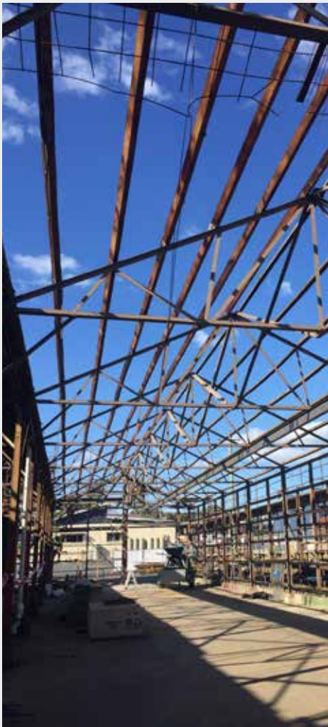
Right: The Maher Street Workshop is currently undergoing a refurbishment.

The refurbishment of Council's workshop in Maher Street, Bega is well underway with all asbestos removal now complete, internal walls demolished, and the old electrical system removed to make way for new wiring. A new switchboard is being built for the workshop which will enable the building to become a solar power distribution point for the rest of the depot. A new 30 kilowatt solar system will help to power the workshop and stores buildings. Looking to the future, there is the capability to install another 50 kilowatts when suitable grant funding becomes available. The long-term aim is to make the depot energy neutral.