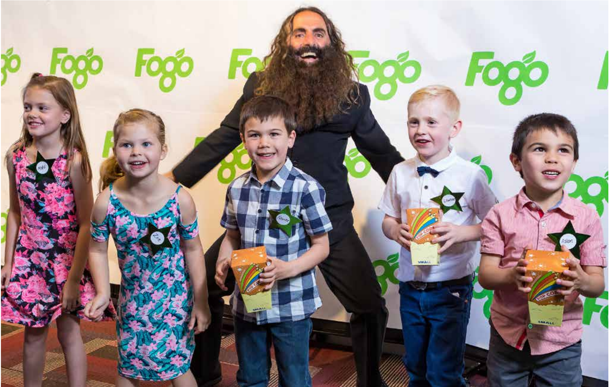
The FOGOmentary film premiere, complete with red carpet and a photo media wall, launched FOGO in the Bega Valley in October 2018. The FOGOmentary features television personality Costa Georgiadis with more than 50 local children who are community champions for changing the way we think about waste.

Bega Valley Shire Council's new FOGO (Food Organics Garden Organics) service and Waste...The Facts have achieved state recognition by winning two major communications awards during Local Government Week.