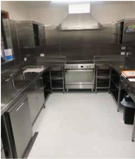
The recent renovation of the Eden Early Learning Centre kitchen means the staff and children are now enjoying much-improved facilities as these before (left) and after (right) pictures show.

We're also planning a building extension to our Eden Early Learning Centre which will enable us to cater for increased numbers of children next year.