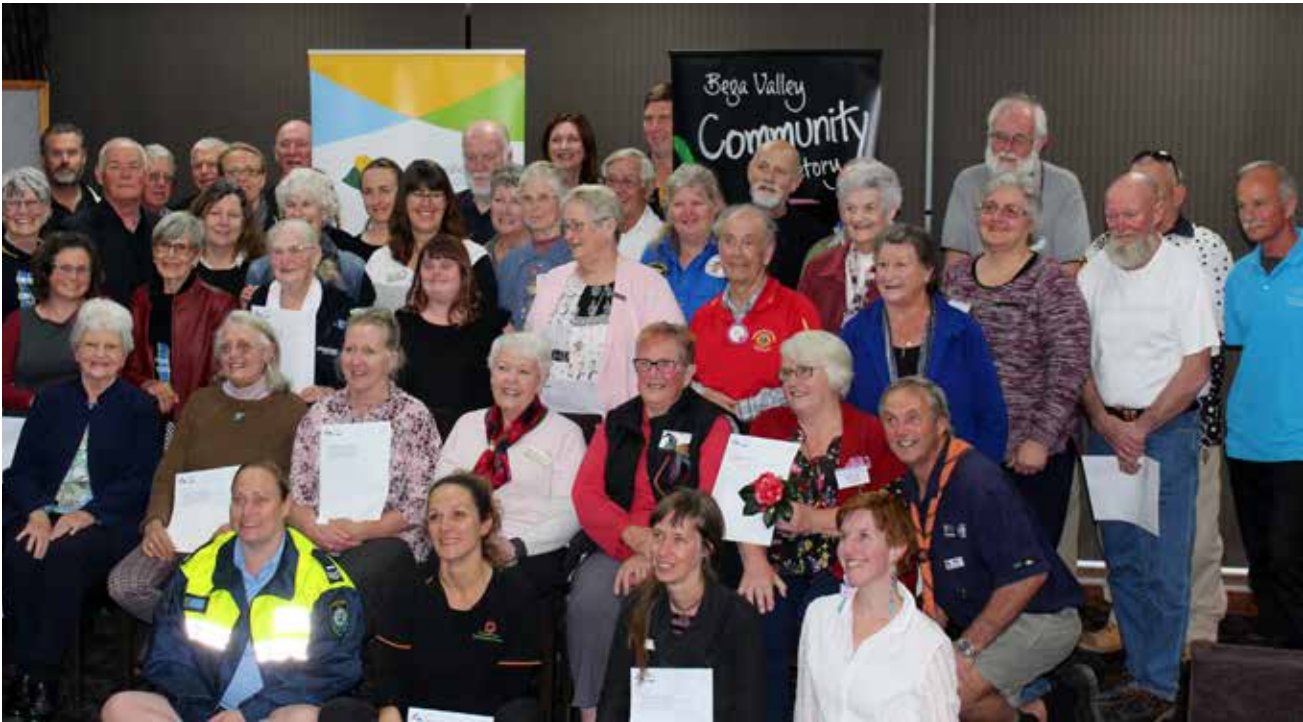
Happy faces representing a number of community organisations at the Bega Valley ClubGRANTS presentation.