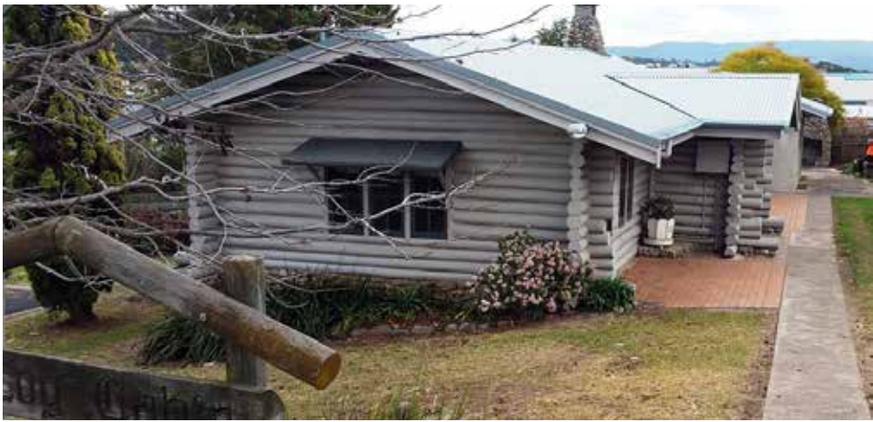
The Eden Log Cabin has a new roof.