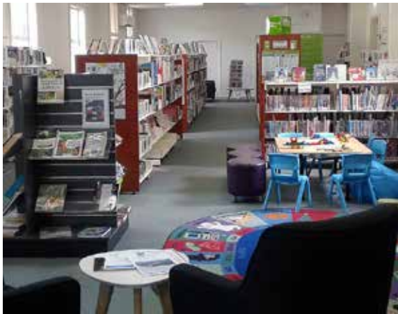
The Eden Library was renovated recently.

These changes are all in line with our newly developed and adopted Library Service Strategic Plan, which has been developed