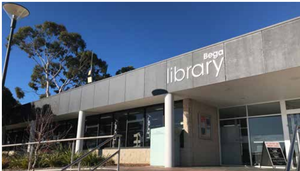
New carpet and a refreshed look is coming to Bega Library.

“Excitingly, school holiday activities will run during the second week of the holidays in the new-look library. “We realise the timing of the closure is not ideal for many people, being the first week of the school holidays, however, we had to meet