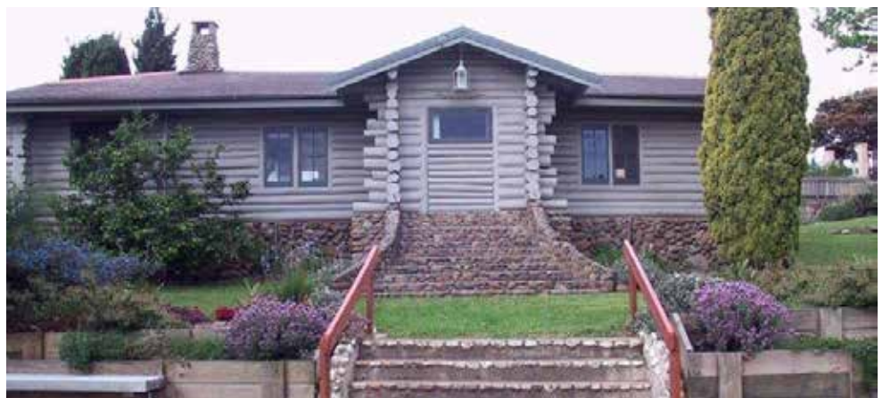
A new roof is on the way for Eden's iconic Log Cabin.

Work has commenced this week on Eden's iconic Log Cabin, with the roof to be replaced thanks to funding made available through the NSW Government's Stronger Country Communities Fund.