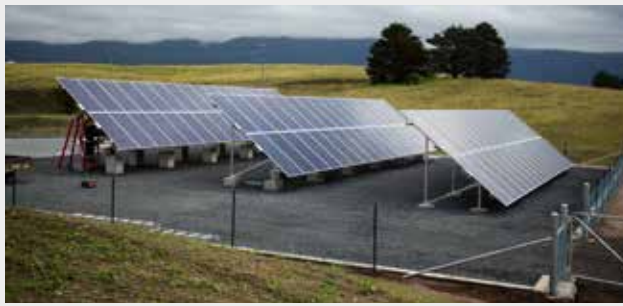
The use of solar at the Bemboka Water Treatment Plant is just one example of how Council is reducing our energy costs and carbon footprint.

"As an organisation, our 10-year plan shows leadership in setting out a process for Council