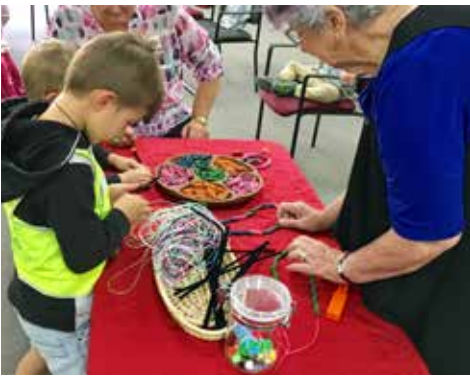
Intergenerational experiences provide enormous benefits for people of all ages.

New experiences and meeting people of different ages and from