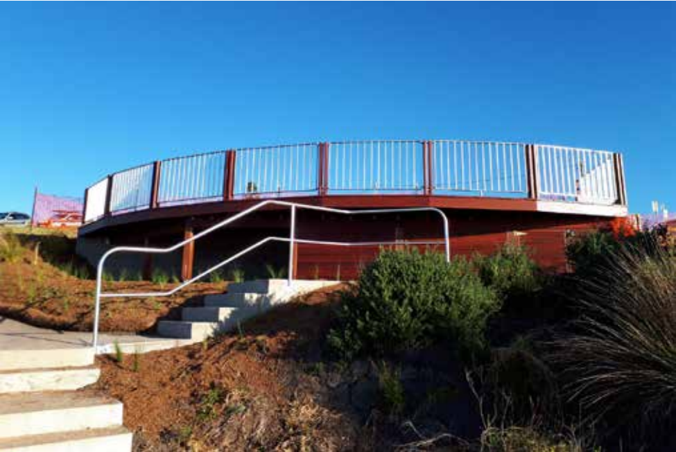
Merimbula's iconic Short Point has a new viewing platform.

Work on the new look viewing platform at Merimbula's Short Point, an early component of the Coastal Accessibility Master Plans for the Shire, has been completed. The upgraded platform was constructed using hardwood, blockwork and galvanised steel and incorporates secure storage beneath the platform for use by surf lifesavers employed at the site during the summer season. The surrounding area has been professionally landscaped and we've also installed two new showers at beach level next to the existing stairs. The works at Short Point are part of the Bega Valley Shire – A Destination for All project, funded through the NSW Government's Restart NSW fund. Council's Coastal Accessibility Master Plans for Bruce Steer Pool (Bermagui), Short Point (Merimbula) and the Pambula Surf Club Precinct (Pambula Beach) can be viewed at www.begavalley.nsw.gov.au/majorprojects .