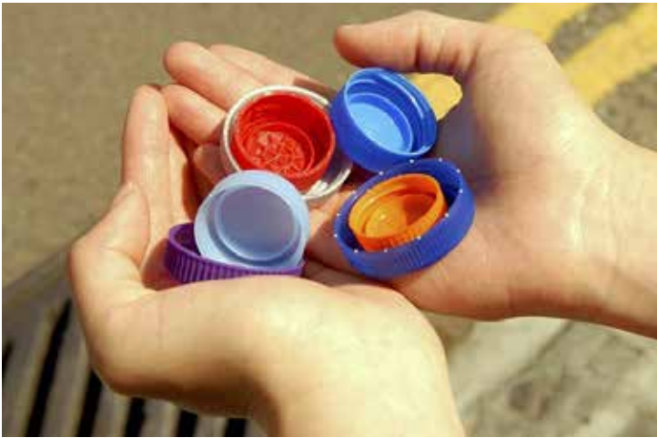
Drop your plastic bottle tops off at our Shire libraries. Envision are turning them into prosthetic hands for disadvantaged children.