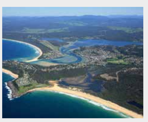
Attendees provided some very valuable information at the recent Merimbula flood study sessions.

For more information, please contact Gary Louie on (02) 6499 2222.