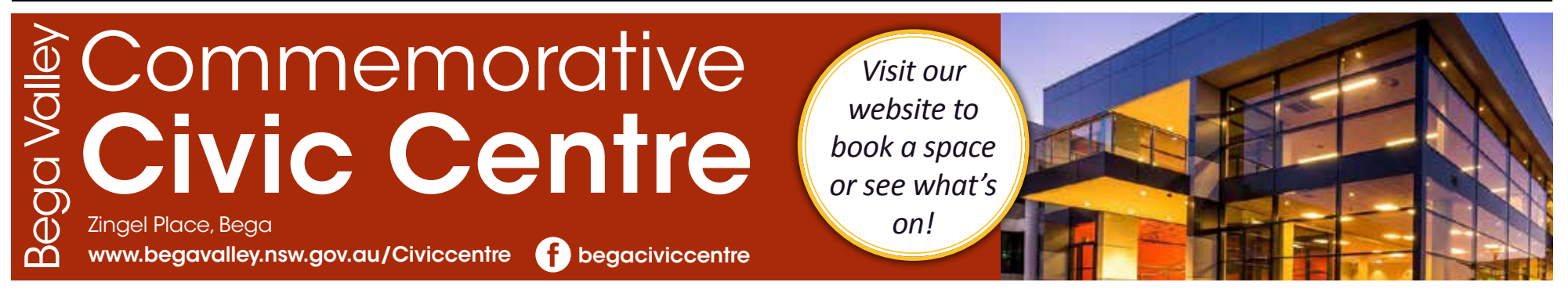
Page 1 - Council News - A Bega Valley Shire Council publication

Planning Panels include Sydney Planning Panels (SPPs) and Regional Planning Panels (RPPs).