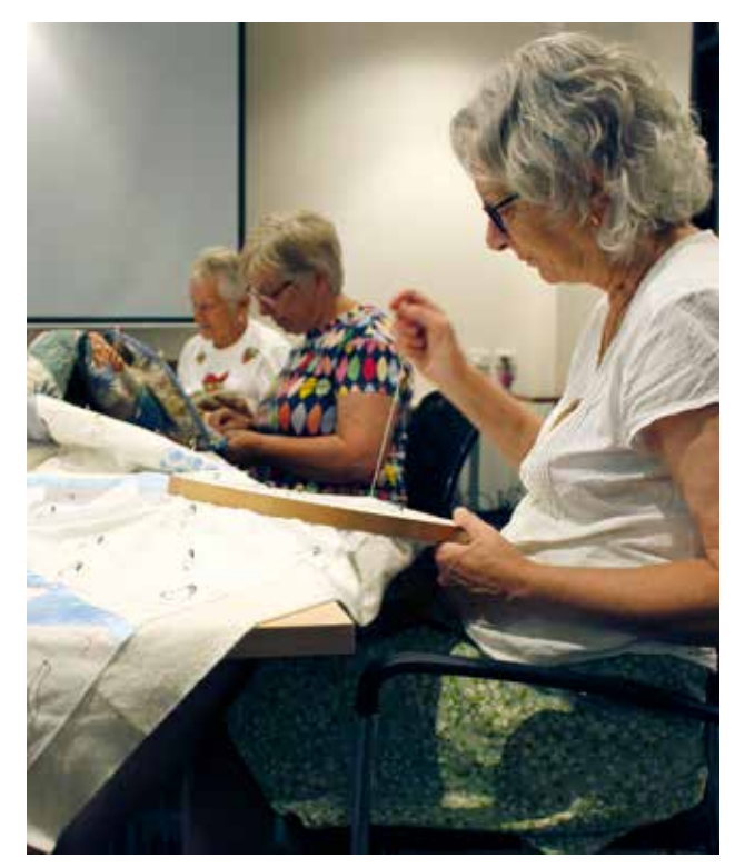
The Tura Marrang Quilters meet on the first and third Tuesday of every month.

"They are much more than just book repositories, we have books, but we have so much more for people of all ages.