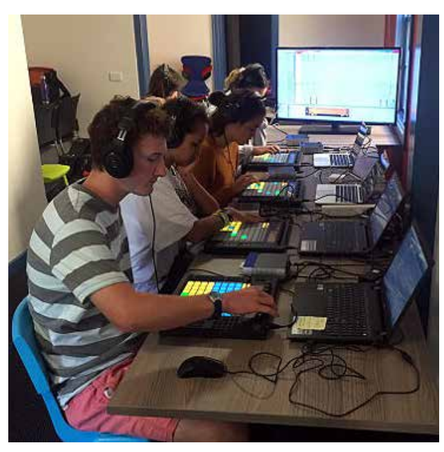
The Making Beats electronic music-making workshops have proven very popular in the past, with another opportunity to be involved coming up in the holidays.

Other school holiday activities include a Making Beats workshop, a Photoshop workshop and a Lego Day, as well as special craft sessions.