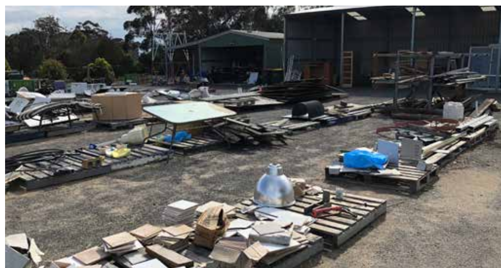
There are plenty of treasures to be found at the Waste and Recycling Resale Areas.

This is the perfect time of year to go treasure hunting at your local waste and recyling centre.