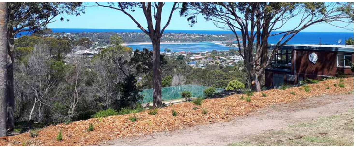
The rejuvenation of Merimbula's Boller Park means that it is now a great place to stop and enjoy the spectacular view.

Our Works Teams take pride in preparing our towns and villages for locals and, particularly at this time of year, for the influx of Christmas holiday makers. All town boat ramps around the Shire were cleaned in November and beach access tracks have been checked and repaired as well. Necessary repairs to Tathra and Merimbula wharves have been carried out.