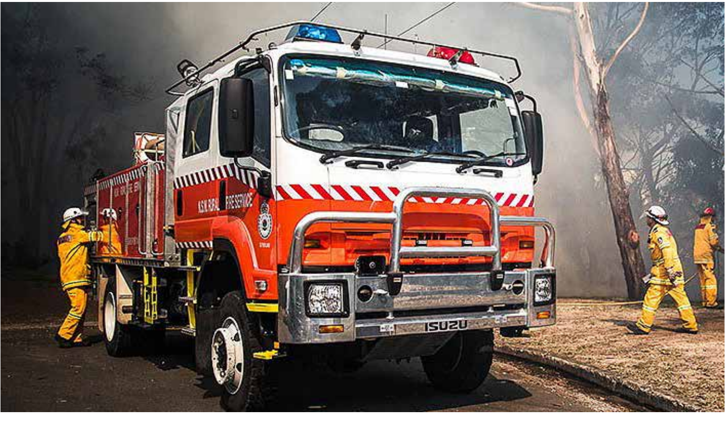
The Rural Fire Service and Council are calling on the community to be prepared for another challenging bushfire season, with soil moisture levels still low despite the recent rainfall.

"We (the Rural Fire Service) are ready to deal with any incidents