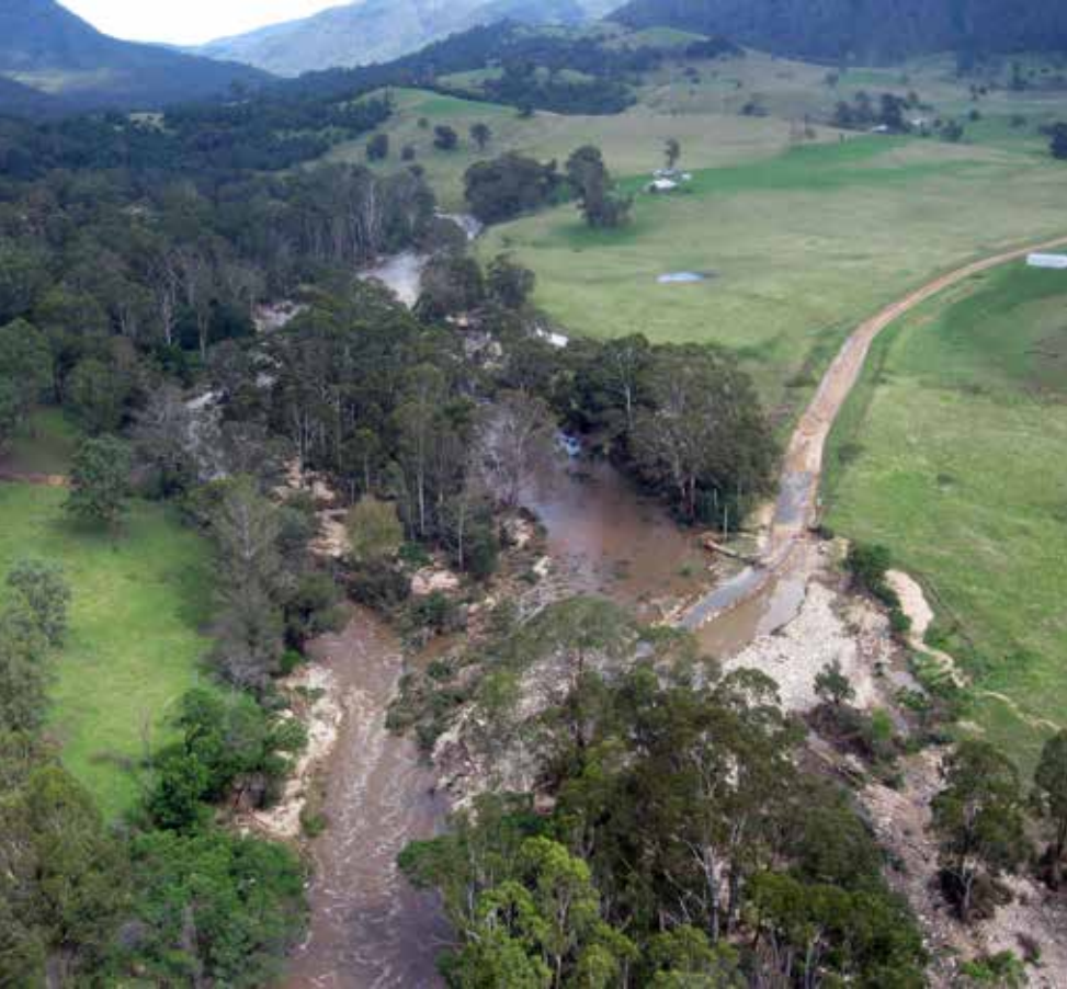
The Stockyard Bridge at Rocky Hall was washed away by floodwaters.