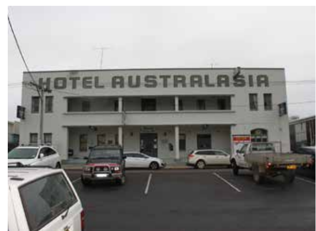
Eden's historic Hotel Australasia.

"It will be just wonderful to see it return to