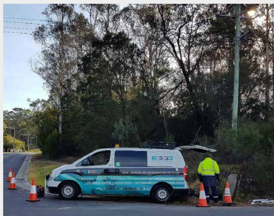
Environmental Services Group has commenced a CCTV inspection program of Council's stormwater network.