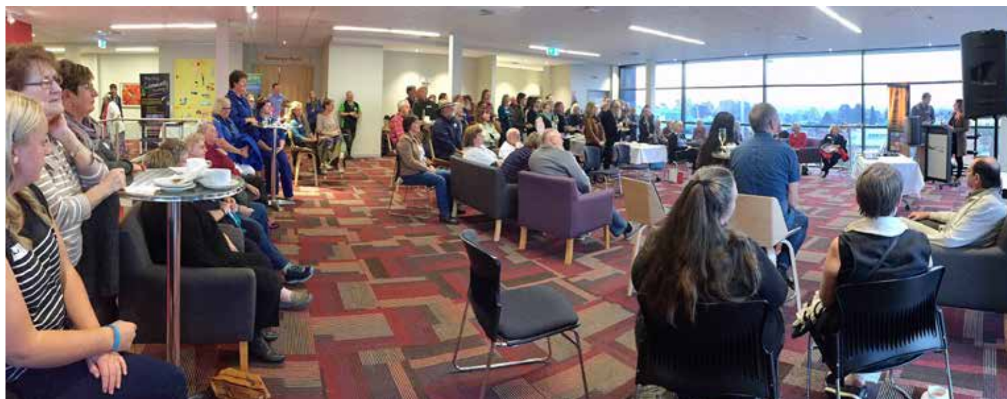
Over 70 people attended the launch of the Bega Valley Community Directory at the Bega Commemorative Civic Centre last Thursday. The launch was part of National Volunteers Week celebrations.

"We encourage community groups and organisations to get on board and use this free resource so