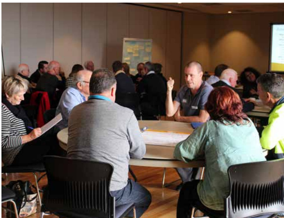
A Council facilitated affordable housing roundtable attracted a broad spectrum of stakeholders and stimulated good discussion around the challenging issue.

The challenging issue of affordable housing was the topic of a Bega Valley Shire Council facilitated roundtable session at the Bega Valley Commemorative Civic Centre on 15 May.