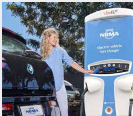
Bega will be home to an electric vehicle fast charging point within a year under an NRMA-led initiative.