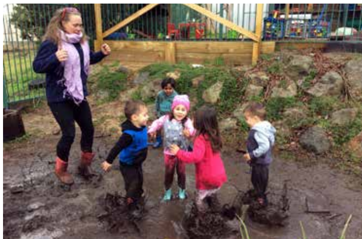
Fun and learning will continue when the Eden Preschool and Eden Childcare Centre merge from January 2019.

"Council has operated all four of its Children's Services (Bandara in Bega and the Sapphire Mobile Preschool as well) for more than 10 years, having taken them on