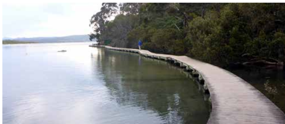
A management plan for Merimbula Lake will be developed this financial year.

The final report of the Coastal Processes and Hazards Definition Study was published in 2015 and is available from Council's website at www.begavalley.nsw.gov.au .