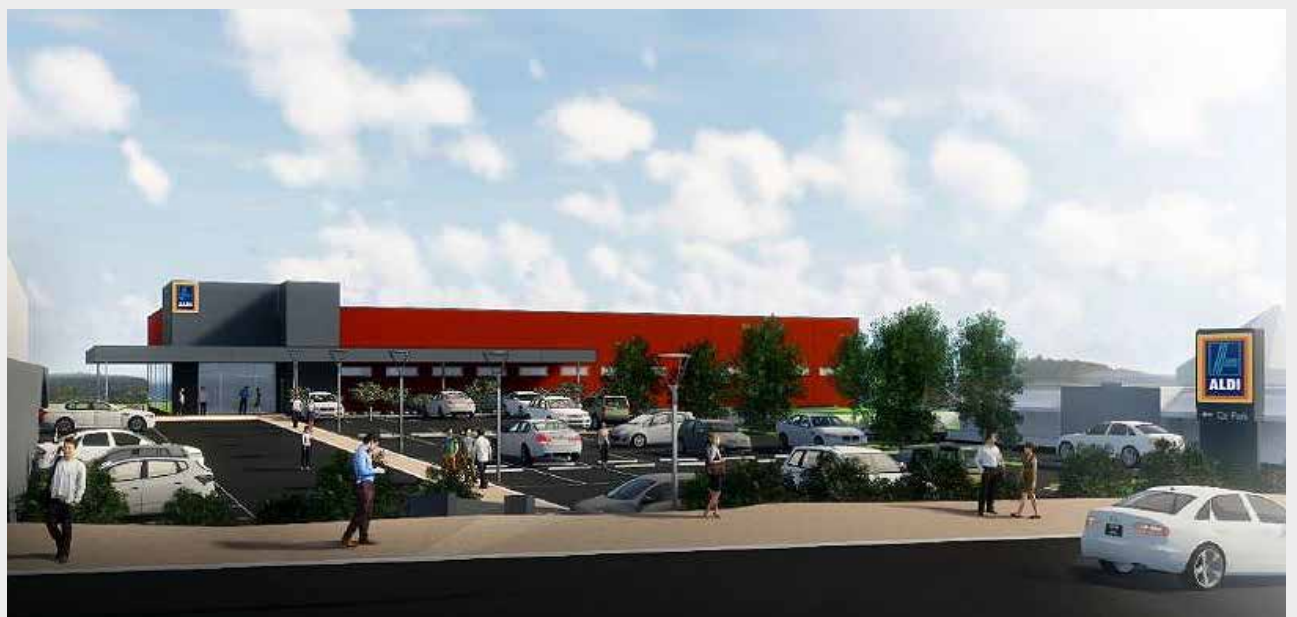
Rothelowman Architects' concept plan for the Aldi supermarket building, which is set to be constructed at 103 & 105 - 107 Main Street in Merimbula after the DA was approved by the Southern Joint Regional Planning Panel (SJRPP).