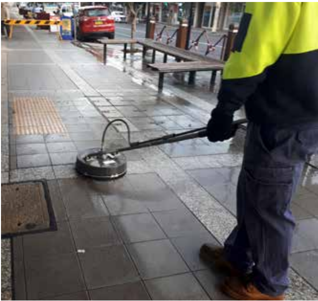
Above: The new steam pressure washer is being put to good use.

The contract street sweeper has been busy sweeping and removing aggregate and debris from Council's rural, regional and urban roads and roundabouts. A total of 123 intersections have been completed in all.