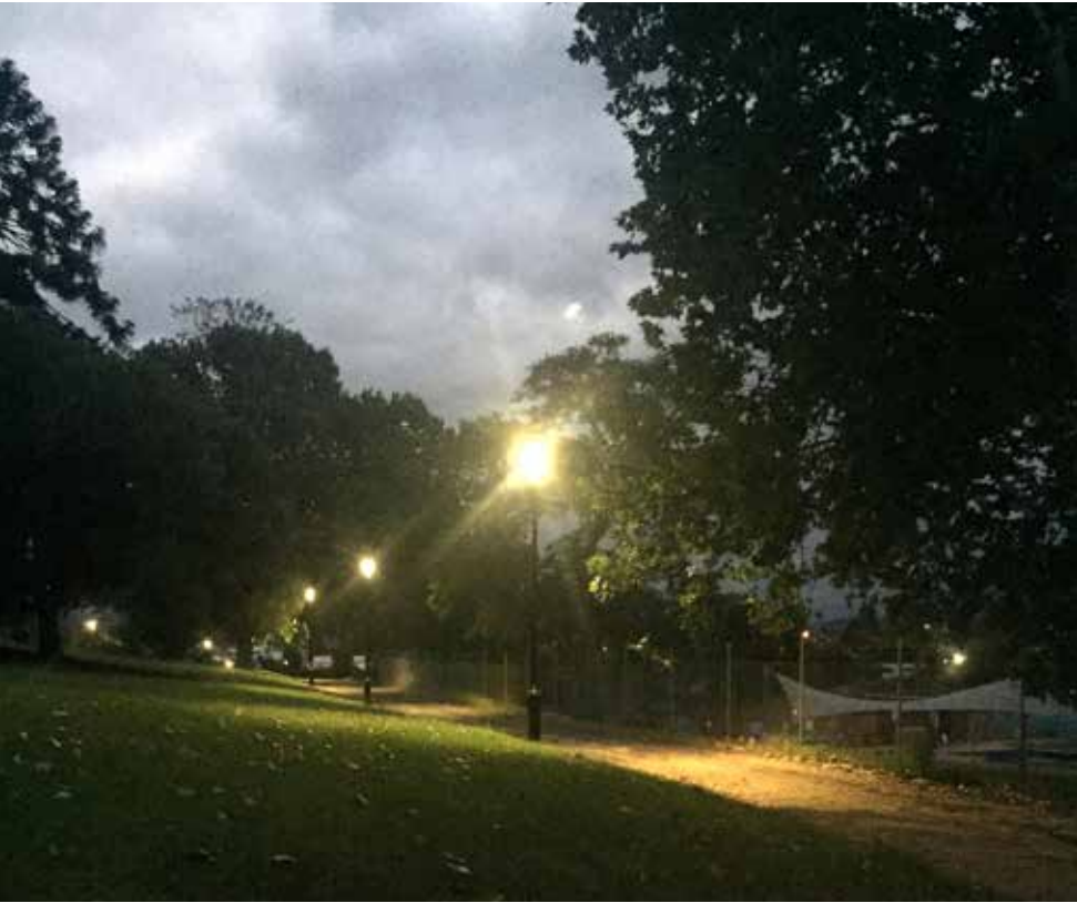
Lighting upgrades have recently been completed in Bega Park (pictured) and throughout the Bega Sporting Complex thanks to Commonwealth Government funding.

Council will evaluate the impact the new lighting has on these recreational areas and the people that use them through consultation with local Police and through online community feedback. If you have any comments in relation to this evaluation you are encouraged to contact Council on (02) 6499 2222.