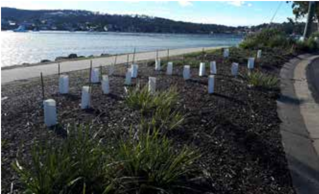
Below: The beautification of Merimbula's gardens has continued at a number of sites.