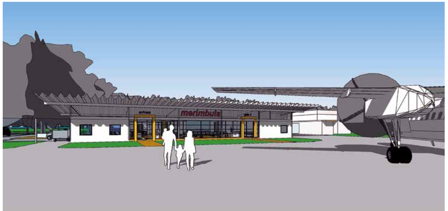
An illustration of what an upgraded Merimbula Airport terminal may look like on approach from the north apron.

Council's project manager, Jenny Symons, said the key aims of the project are to improve passenger comfort and safety and importantly future-proof the airport for the foreseeable future.