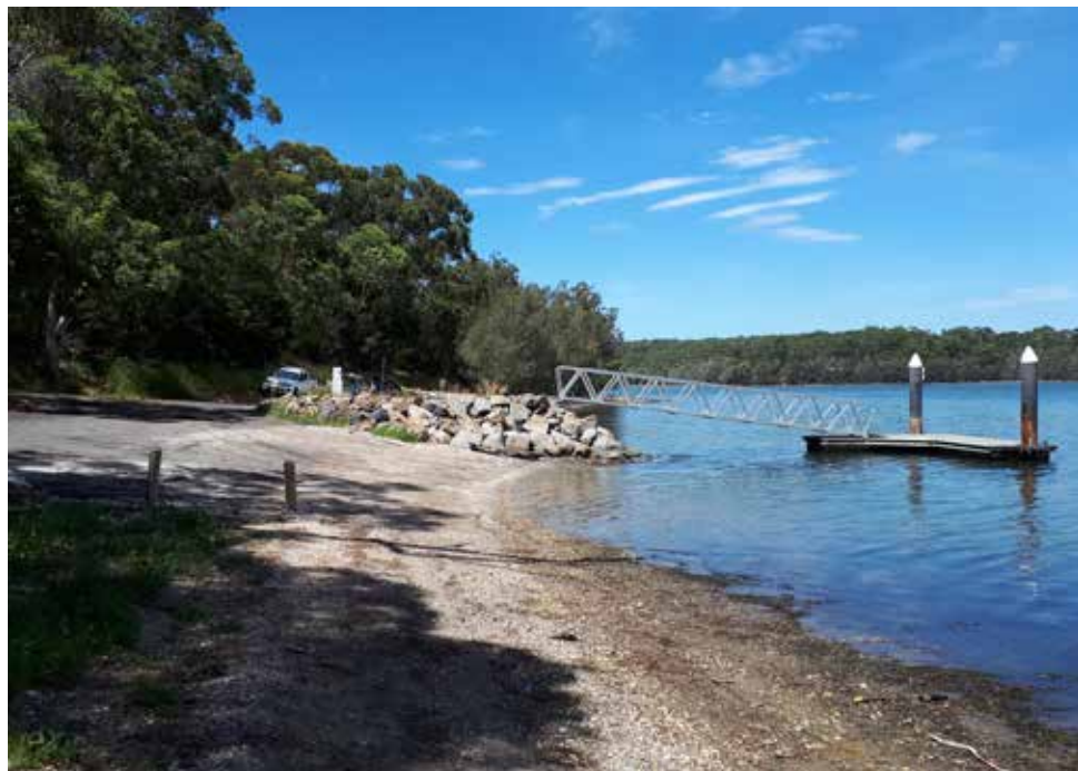
Users of the the Beauty Point Boat Ramp will soon enjoy greatly improved access to the water, with a major upgrade set to commence later this month.

Sydney based specialist marine construction company, which worked on the Mogareeka boat ramp in 2016, have been engaged to carry out the construction.