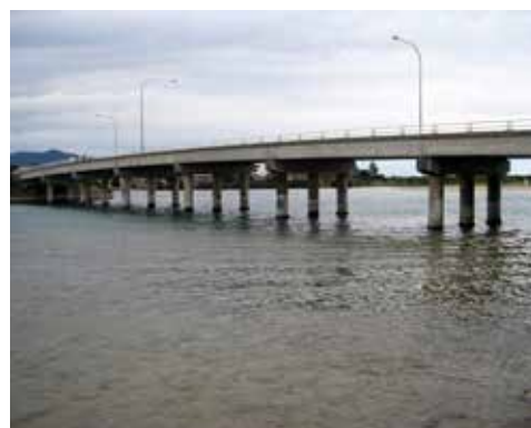
Work on the Bermagui Bridge represented a portion of the near $1.5 million Council invested in the Bermagui township transport network during the 2017-18 financial year.

Safe and convenient roads, pathways and cycleways enhance