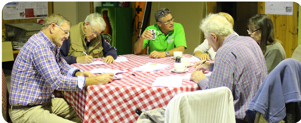
Photo: Wonboyn residents work with Council on the Community Strategic Plan.

People in the Shire's towns and villages are getting behind Council's biggest community consultation with more than a thousand surveys completed in the first two weeks. The Understanding our Place survey is the first stage of revising the Council's Community Strategic Plan. We are trying to establish our communities' aspirations, outlining the hopes, priorities and values of local people.